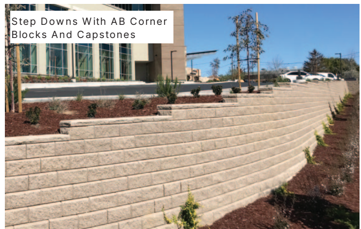
Step Downs With AB Corner Blocks And Capstones