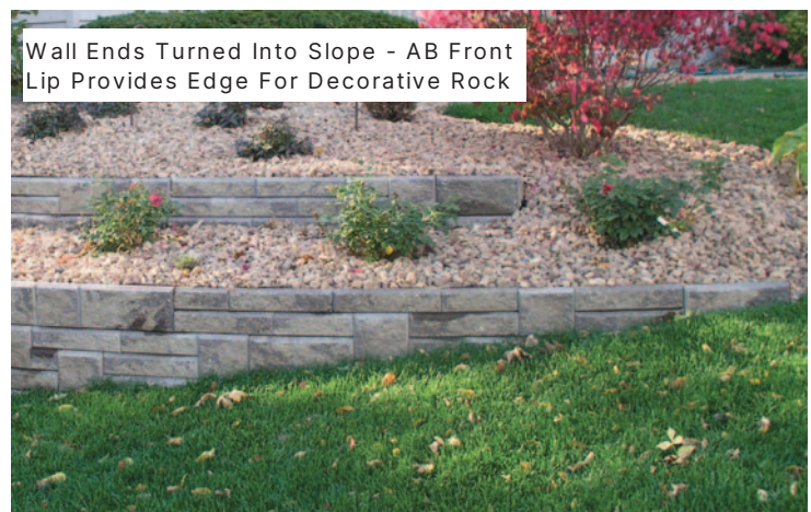
Wall Ends Turned Into Slope - AB Front Lip Provides Edge For Decorative Rock