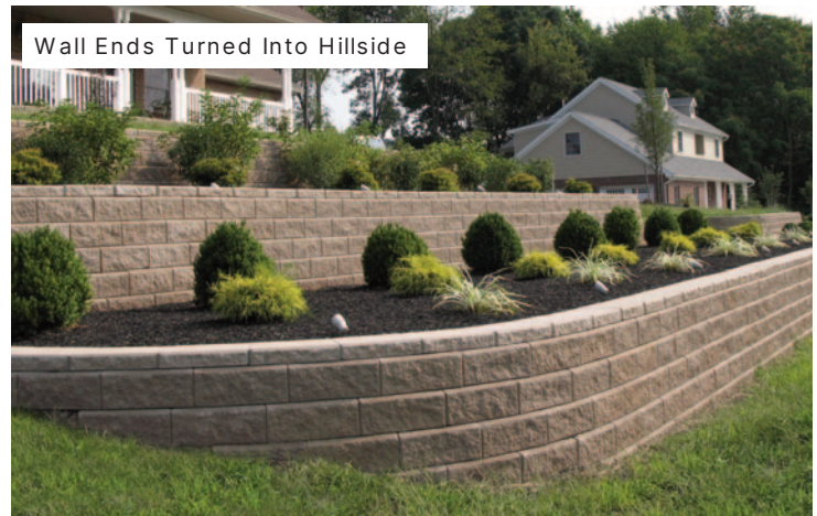
Wall Ends Turned Into Hillside

Choose a wall topping or finish material to match your landscape project. Allan Block's built-in front lip provides a natural edging for a variety of finishing materials including AB Capstones, landscape pavers, poured concrete, crushed rock, flagstones and mulches.